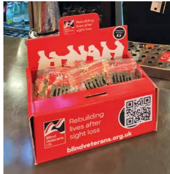
Caption: Order your pin badges

Help spread the word about our amazing charity by placing a box of 'Victory Over Blindness' badges in your