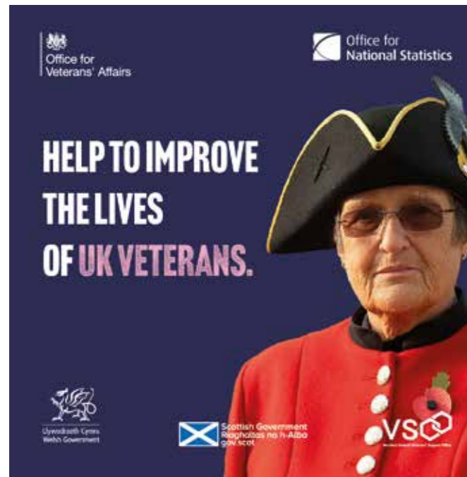
Caption: Veterans' survey out now

This important survey was launched on 10 November and will be live until the end of January. It gives you and your family a chance to provide direct feedback to the Government on your experiences, describing what life is really like for vision impaired veterans.