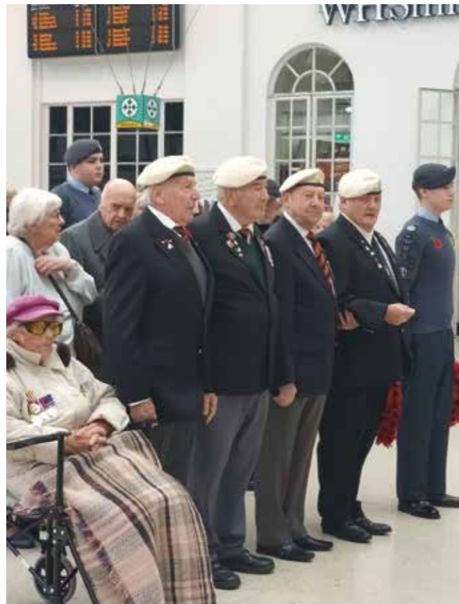
Caption: Our Members lined up at Brighton Station

The usual hustle and bustle of Brighton Train Station was replaced with silence at 11am on Friday, 11 November, as commuters, staff and veterans stood together side by side to remember those who sacrificed their lives to ensure we all enjoy the freedoms we have today.