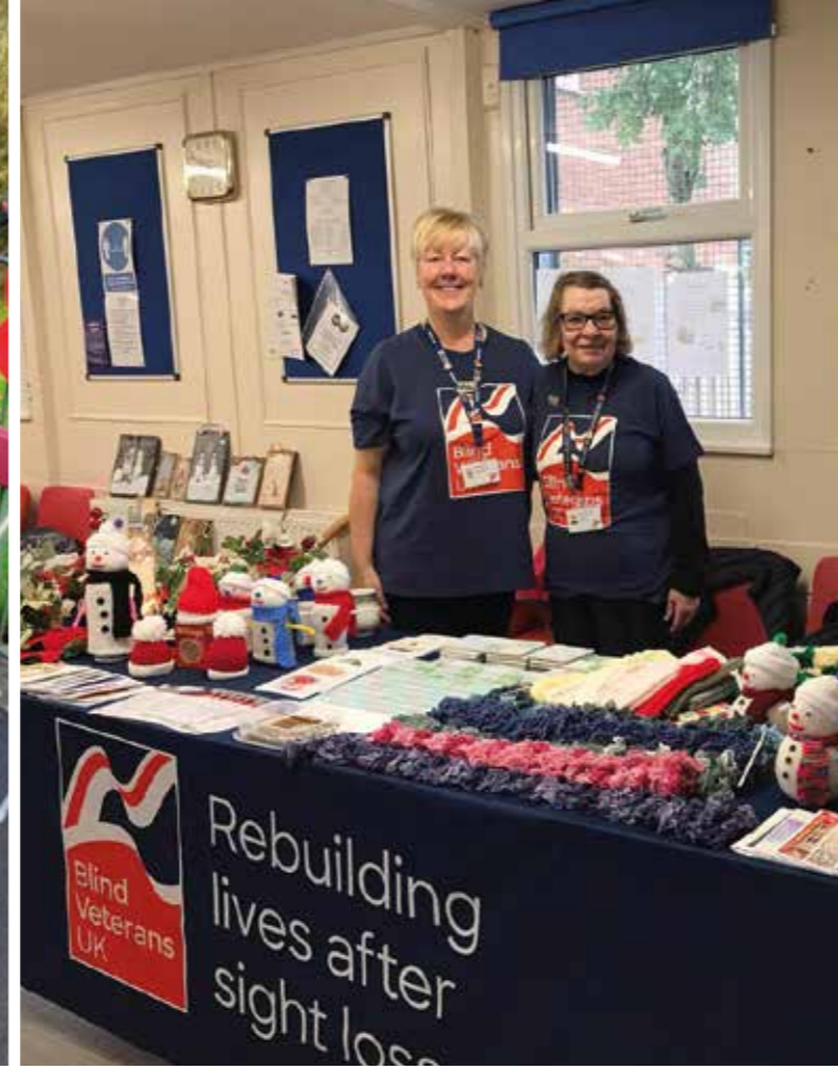
Caption: At the Christmas fare with her stall of items made by Members

I've received all kinds of practical support from the charity too – a keyboard, a penfriend, a mobile phone (which brought me into the 21st century!). In fact, during the lockdown, even before I'd met the staff properly, they sent me talking weighing scales