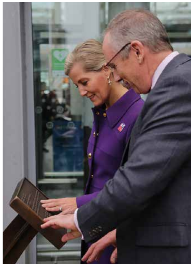
Caption: With the Countess of Wessex in Manchester, 2018