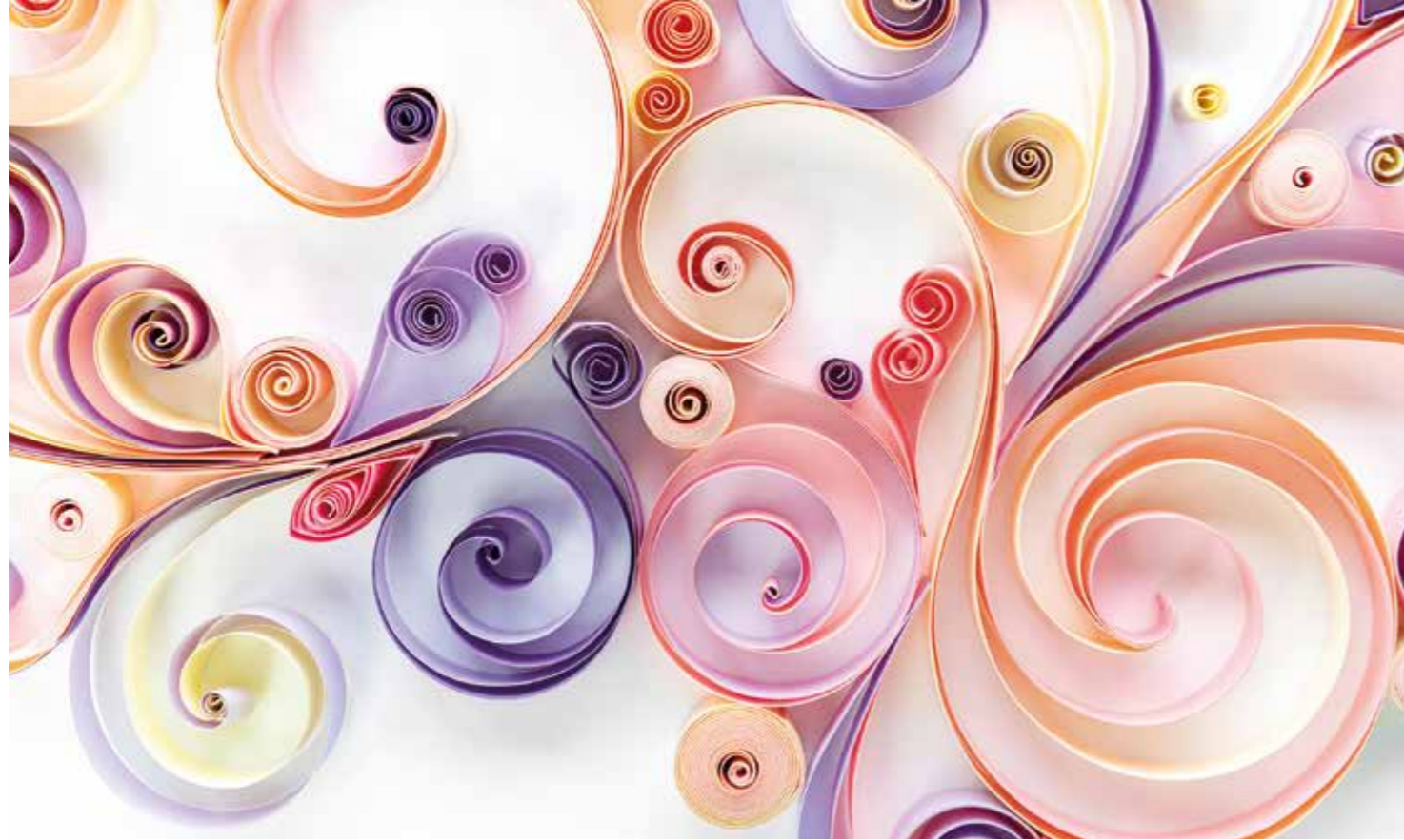
Caption: Beautiful patterns made from paper craft quilling