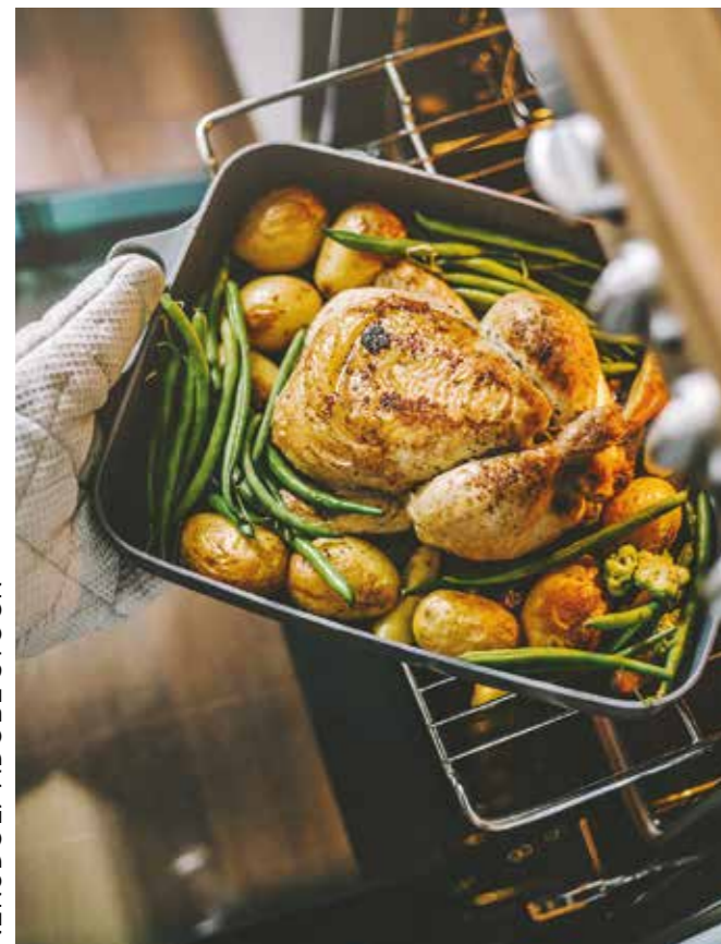
Caption: Get help with the cooking

There's nothing more annoying than mixing up similar-shaped bottles, especially if this means washing your hair with conditioner instead of shampoo before your big Christmas do!