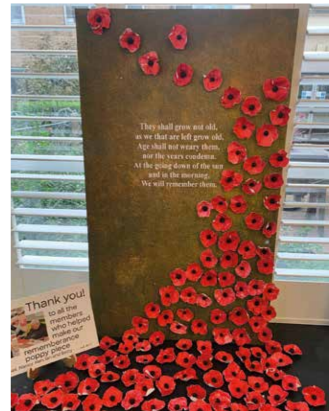
Caption: The poppy artwork

Meanwhile, as part of the Remembrance preparations, a group of Brighton residents joined staff in the Arts and Craft workshop to create a spectacular Remembrance poppy piece. The collaborative artwork took pride of place at the centre. 🇬🇧