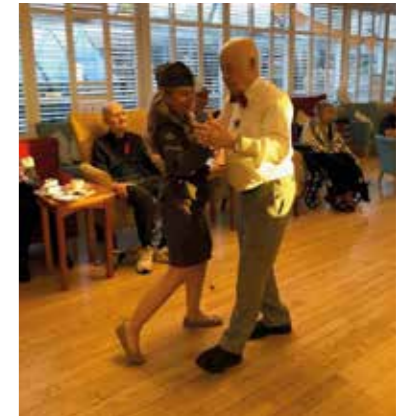
Caption: Members joined in a tea dance

Portsmouth and a fascinating display of old military vehicles from the Invicta Military-Vehicle Preservation Society.