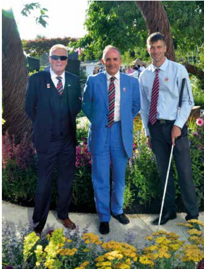
Caption: At the Hampton Court Garden Festival in 2017

He seemed to be able to take life and sight loss in his stride and possessed great wisdom. It was wonderful a few years later to see our RM members of staff escort him to the Commando Memorial at Spean Bridge for his last parade.