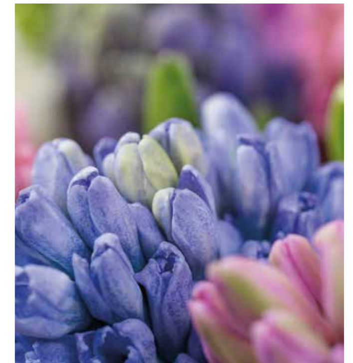
Caption: Blue and pink hyacinths