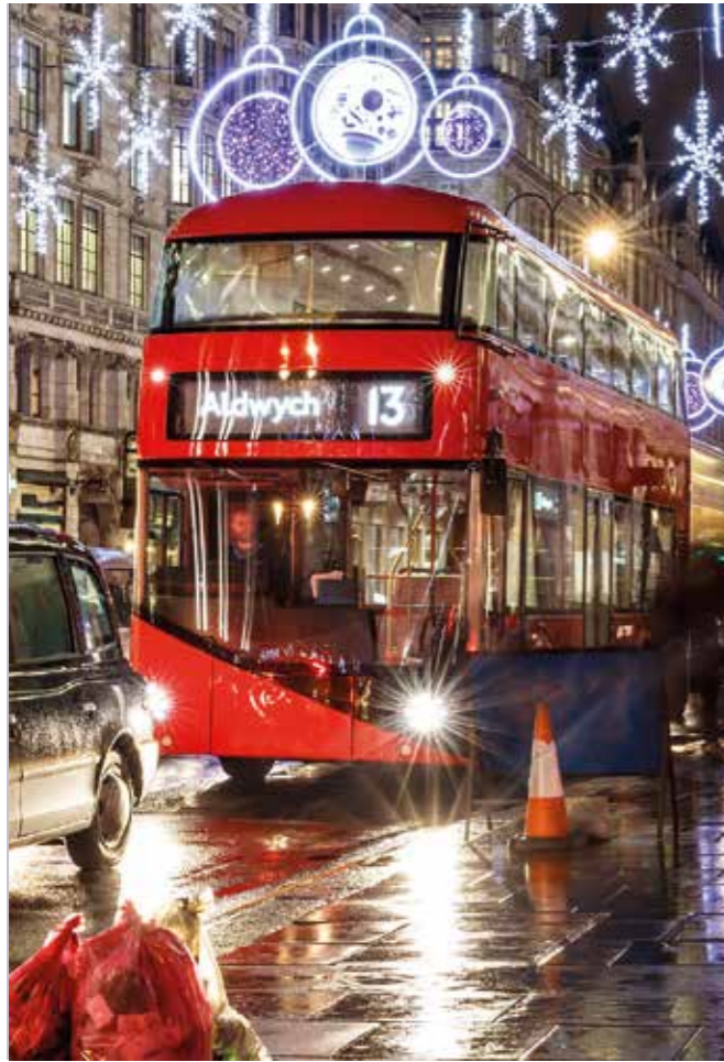
Caption: Find the best route

Alexa will tell you what station and route you need to take, as well as the time of the next service and how long your journey will be.