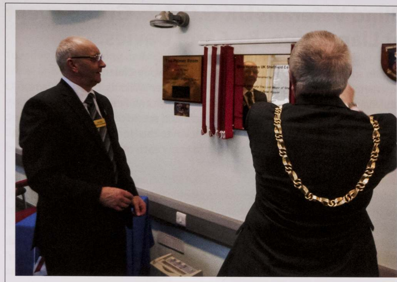
Picture opposite: The Lord Mayor of Sheffield Cllr Peter Rippon unveils the Sheffield centre's new plaque.