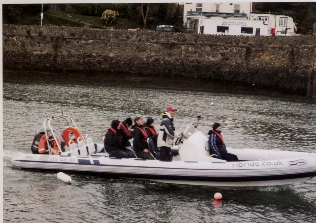
Picture: The fast moving rib ride in Anglesey.

We were given instructions before setting off on our walk and I really do mean walk. Not a canter and definitely not a gallop. We had a very leisurely ride down the country lanes and back into the stable yard where we all had to dismount, some more gracefully than others, I will say no more on that subject. Those who bore witness could tell a different story.