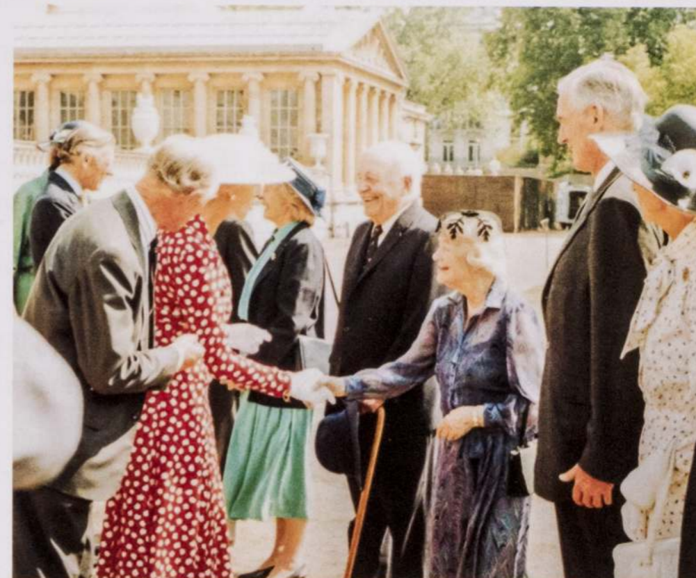
Picture: HRH Princess Alexandra meets members at the 75th anniversary garden party at Buckingham Palace.

A camera. Any luggage or bulky items e.g. rucksacks or holdalls. Mobile telephones are permitted but must be switched off when in Buckingham Palace grounds. We advise that if you are meeting friends you arrange to meet before entering Buckingham Palace and enter the Garden Party together. It will be very difficult to find your friends and colleagues once in Buckingham Palace grounds due to the number of guests attending.