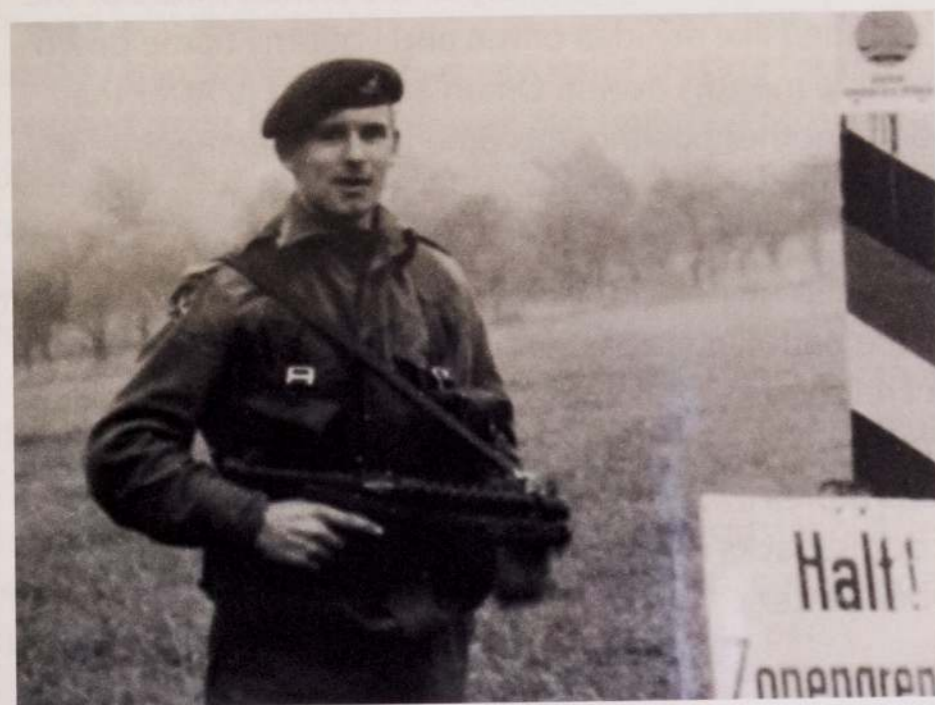
Picture: On border security in Germany.

"Back in Civvy Street I'd met a girl from Coventry so I settled down there and started work in a garage. It was just like serving my apprenticeship all over again. My days consisted of changing oil filters, tyres, exhausts, replacing clutches, brake pipes etc and I was beginning to get weary of it. I thought there must be something better than this! One night as I sat watching motor racing on the telly I saw the mechanics milling around in the pits and said to myself, these guys must be the best of the best, I'm going to see if I can get into that.