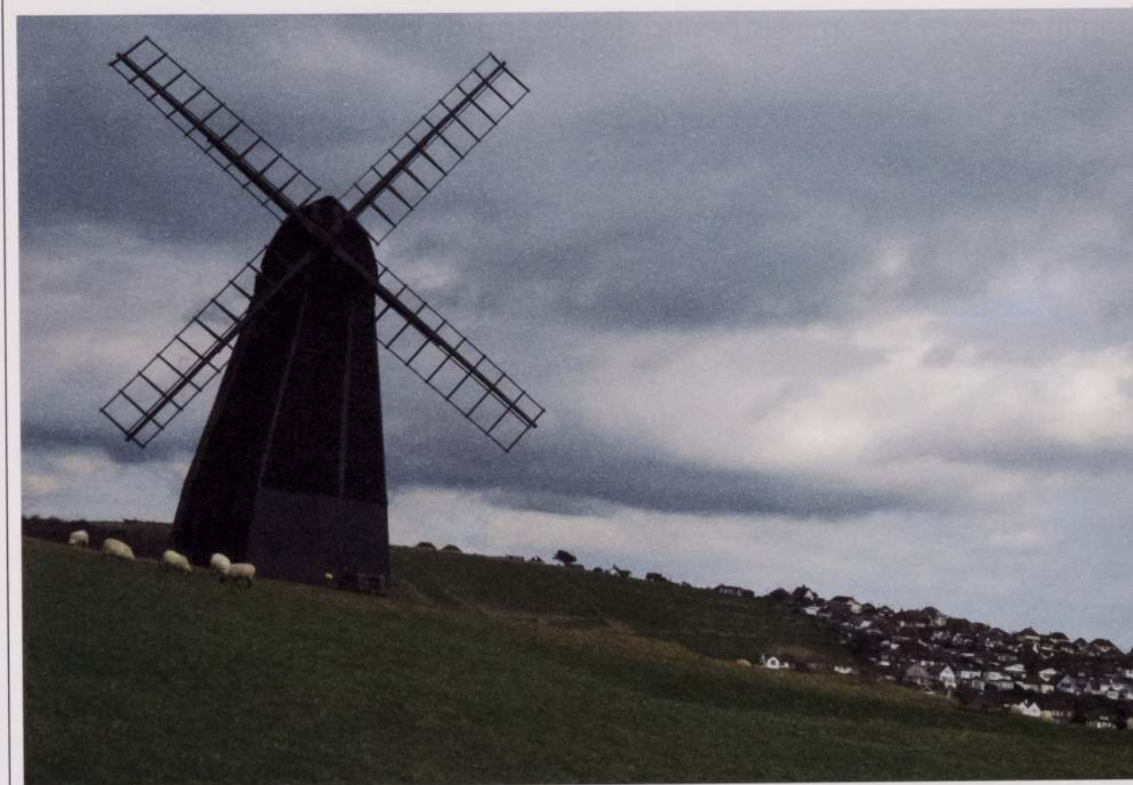
Picture: The windmill near the Brighton centre