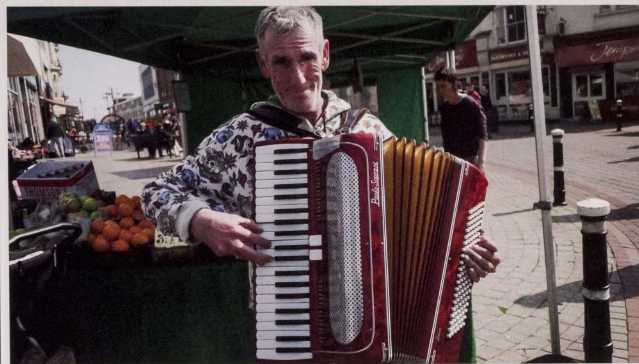
Picture: An accordion player