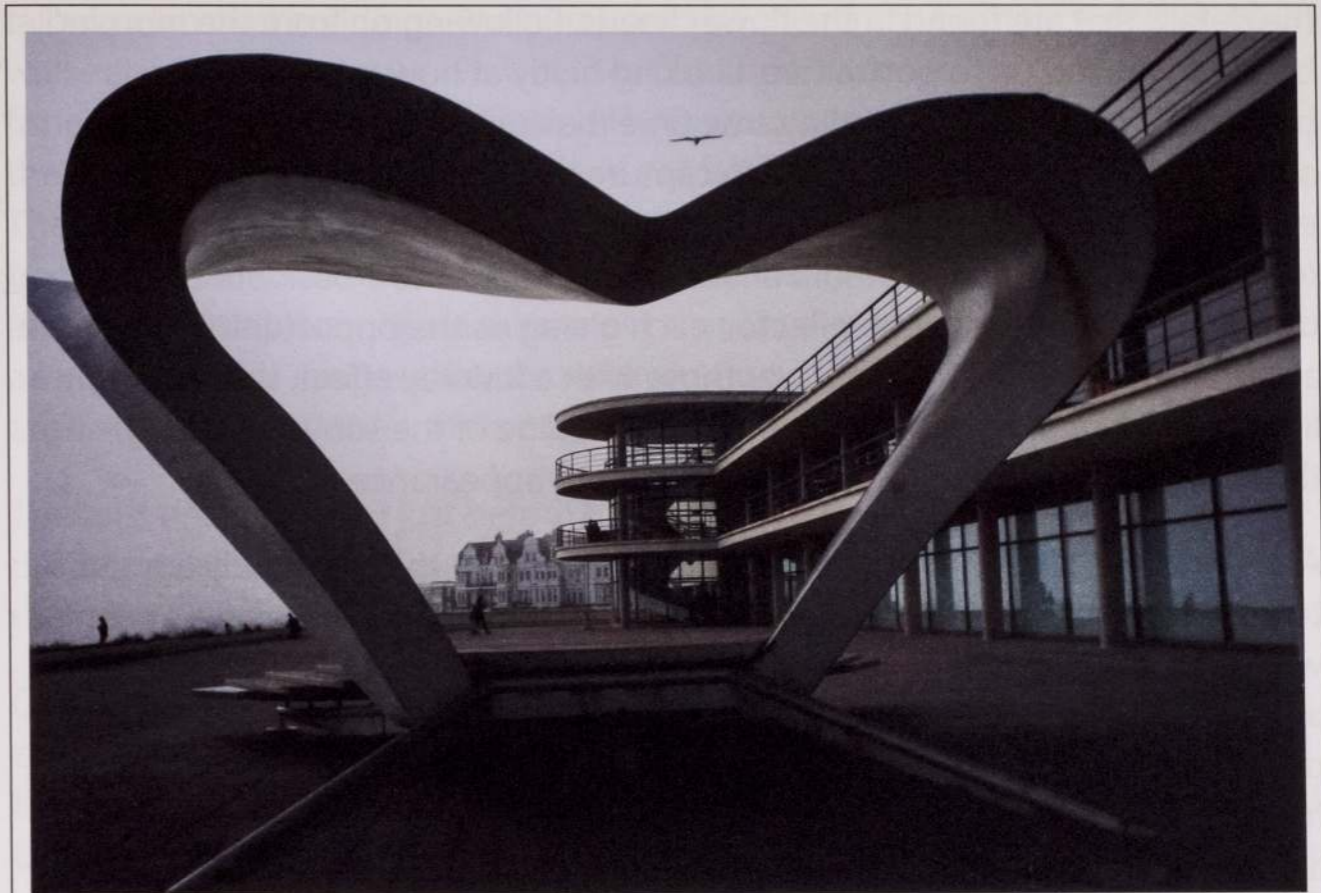
Picture: The De La Ware Pavilion at Bexhill on Sea

Wednesday saw most of us continue to capture a variety of different close up; floral images, taken both from a distance and closer up as we concentrated on