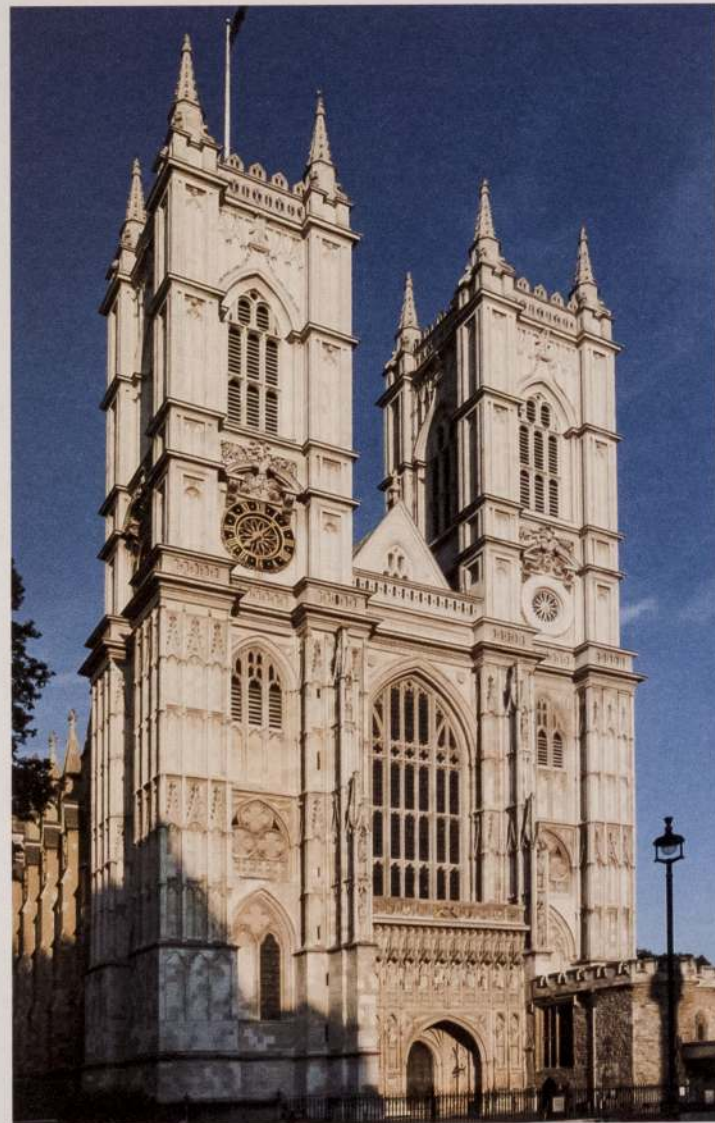
Picture: The splendour of Westminister Abbey.