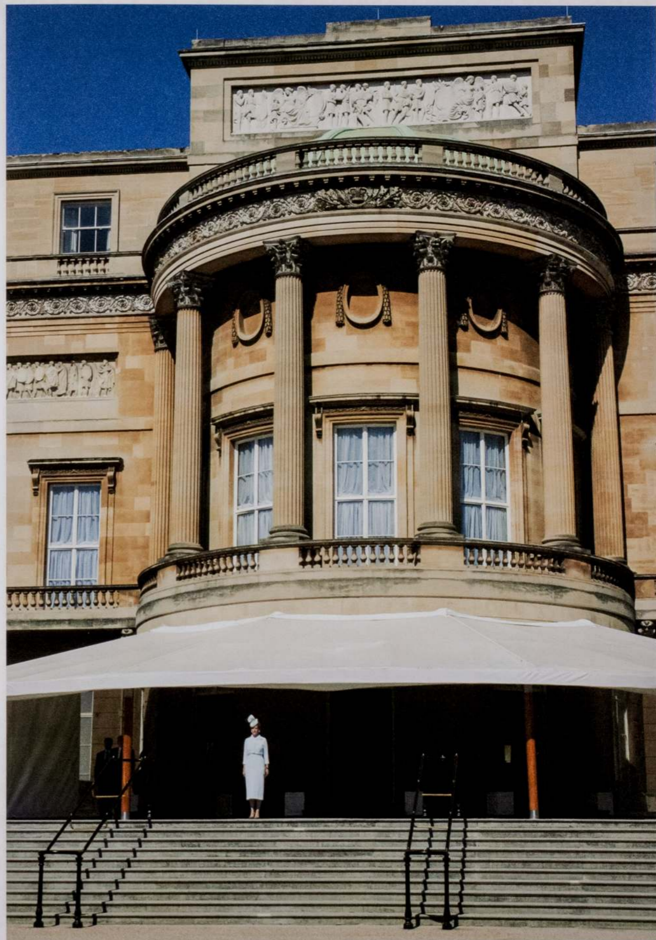
Picture: The arrival of HRH The Countess of Wessex.