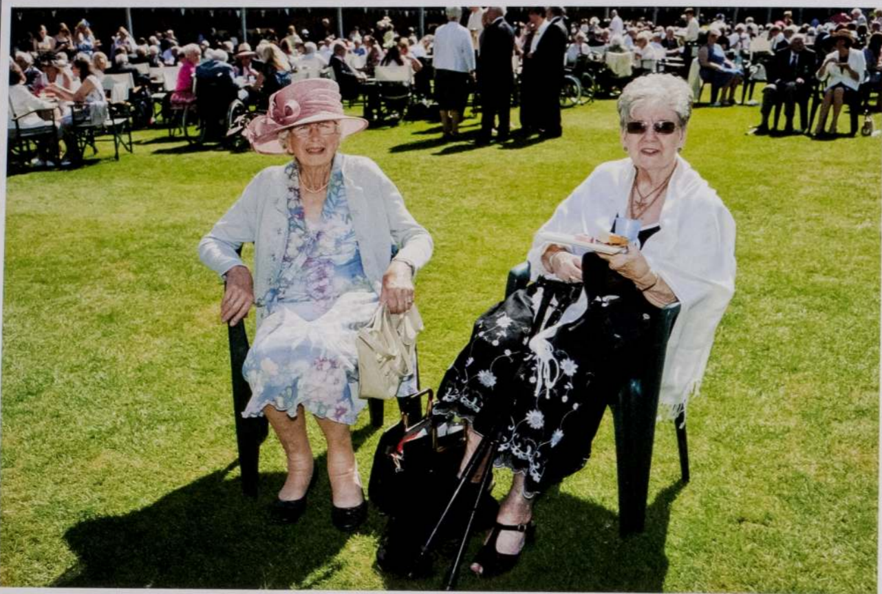
Picture: Time for tea.