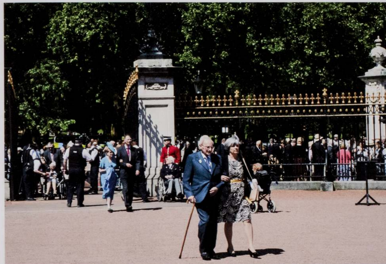
Picture: Arriving at Buckingham Palace for our centenary Garden Party.

One amazing day, the DVD of our Centenary Garden Party, is available to buy for £10, which includes p&p. You can buy it at our online shop at http://shop.blindveterans.org.uk or telephone 0300 111 0440 for credit or debit card orders. When you place your order please quote the reference Review. If your photograph is not included in this Buckingham Palace Garden Party special edition of the Review you could quite possibly find yourself in the DVD.