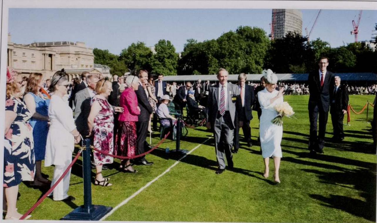
Picture: The party's almost over. HRH The Countess of Wessex waves and stops to chat to blind veterans as she leaves after many hours of speaking to so many members of the family of Blind Veterans UK.