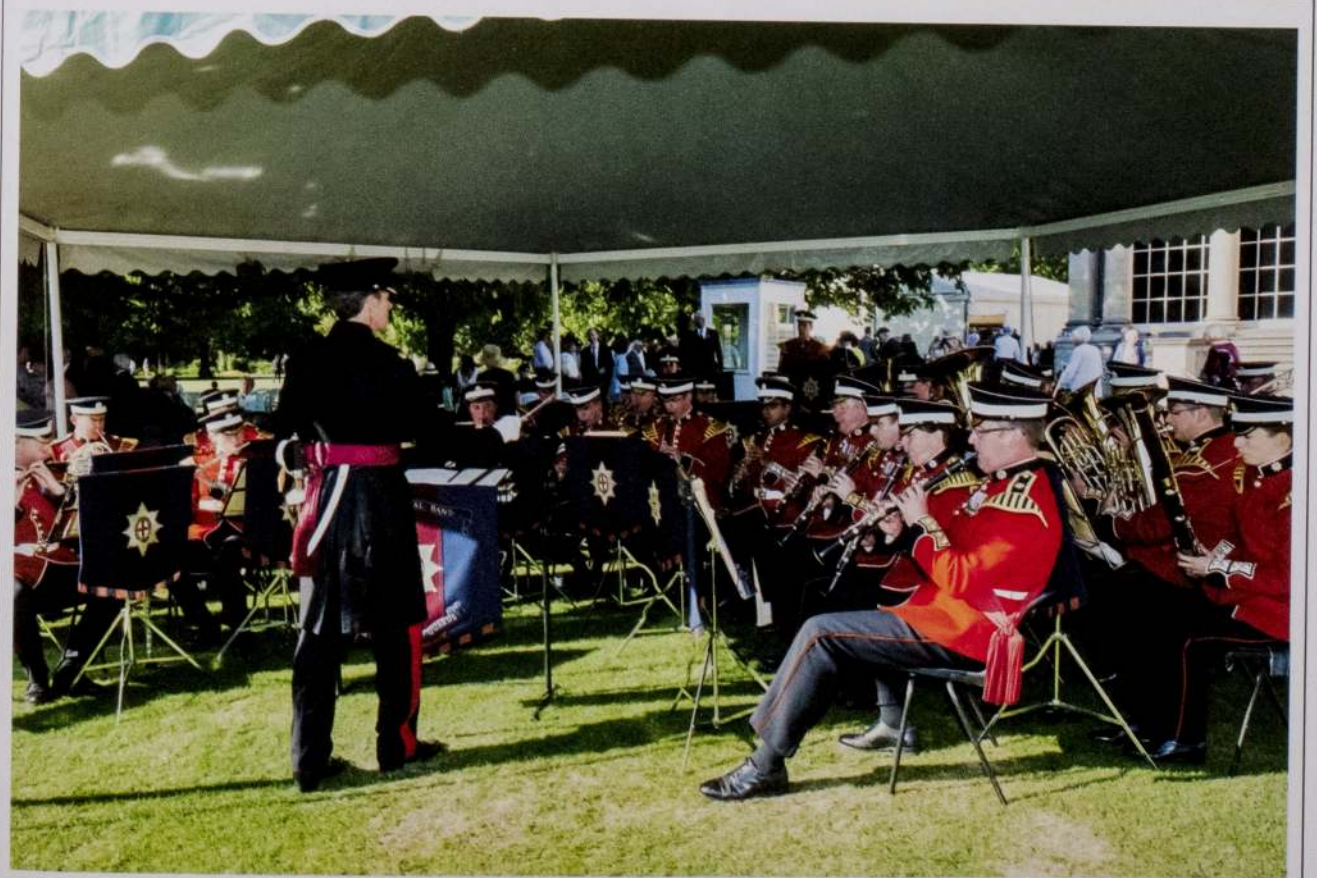
Picture: And the band played on.