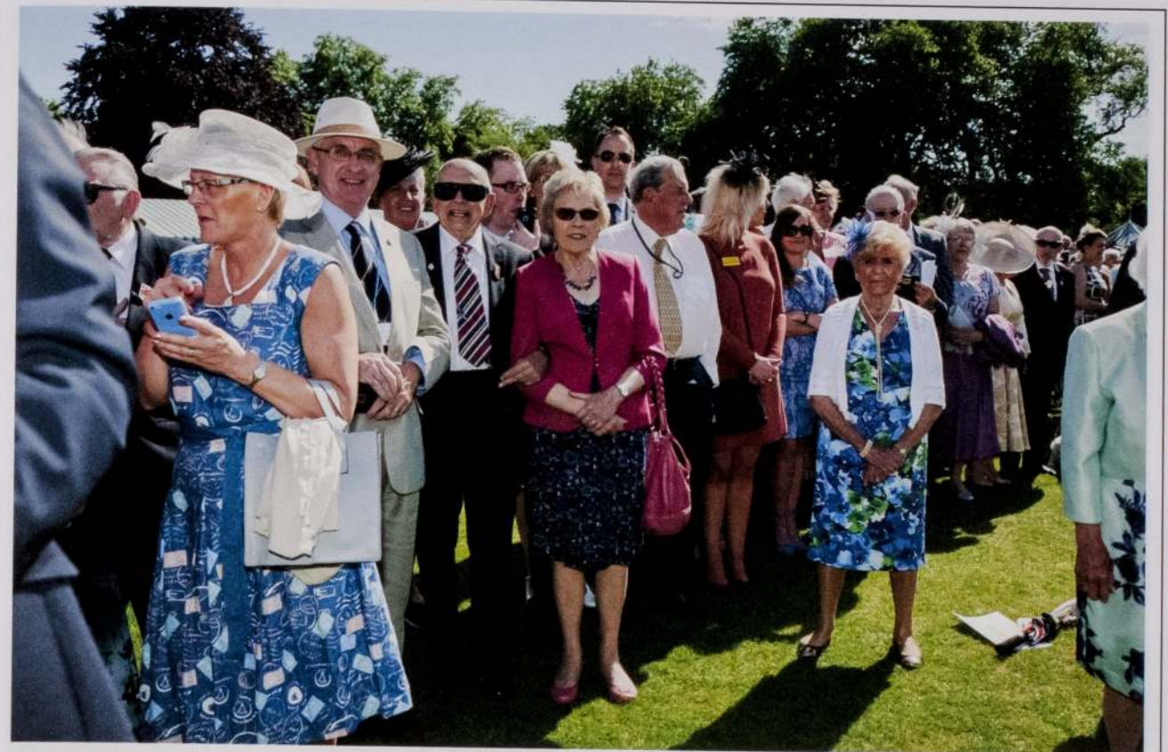
Picture: Watching the Countess as she meets blind veterans and their families.