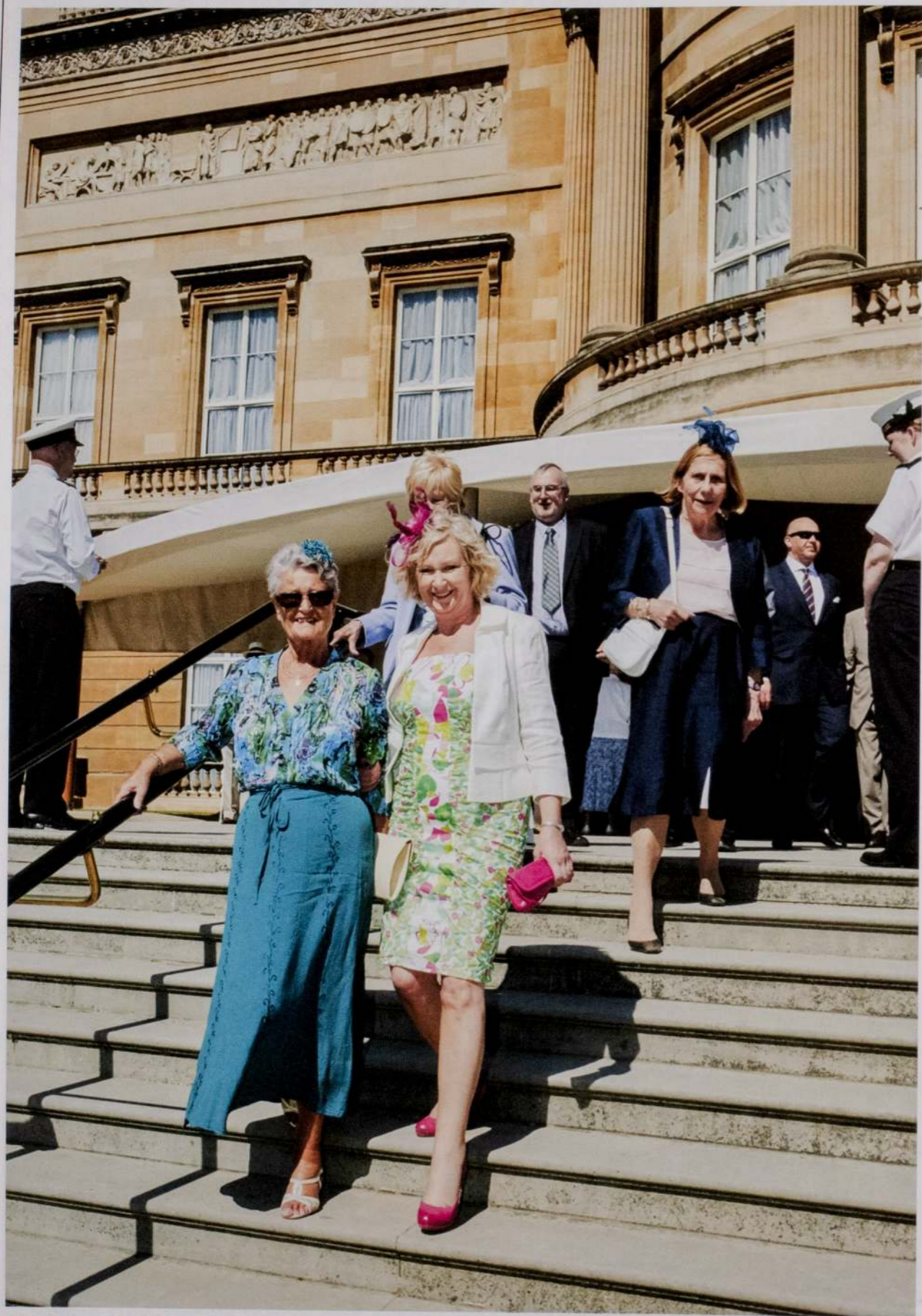
Picture: Taking the steps from Buckingham Palace into the gardens.