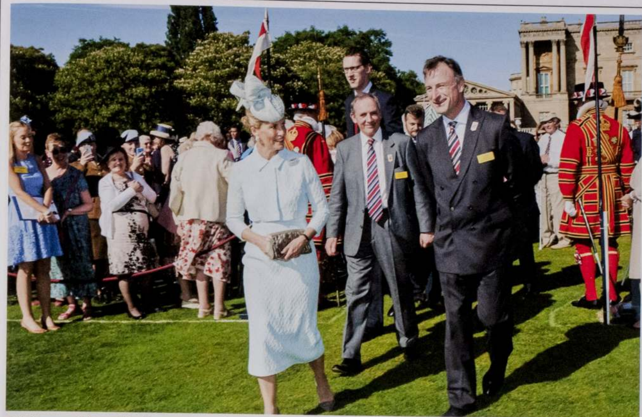
Picture: The Chairman and Chief Executive escort HRH The Countess of Wessex to the Royal Tea tent.