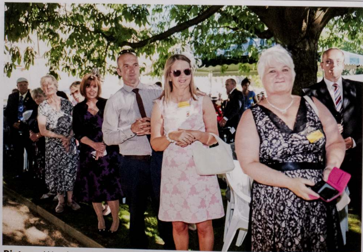
Picture: Watching the Countess.